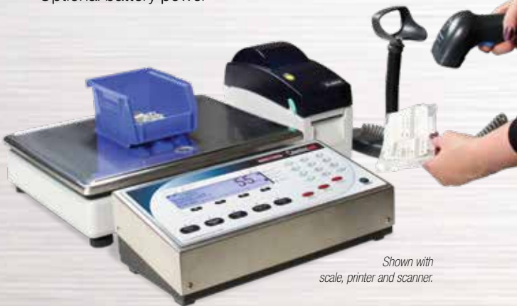
Shown with scale, printer and scanner.